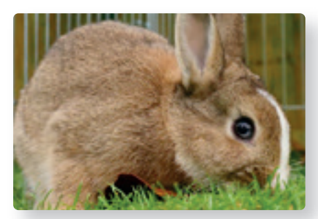
£3 feeds a rabbit for a week