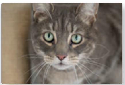
£5 feeds a cat for a week